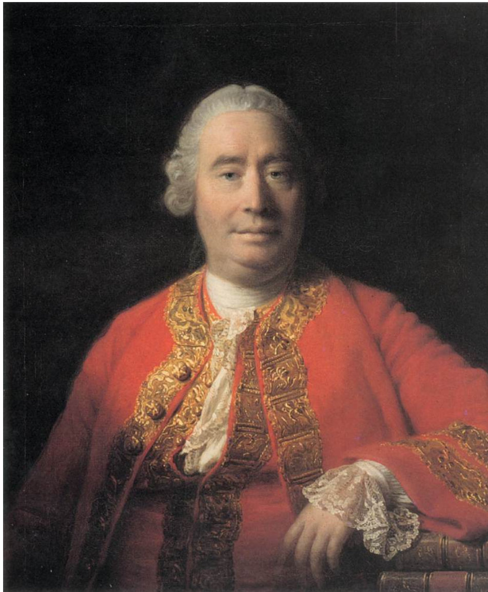
David Hume, Scottish Sceptical Philosopher: 1711-1776