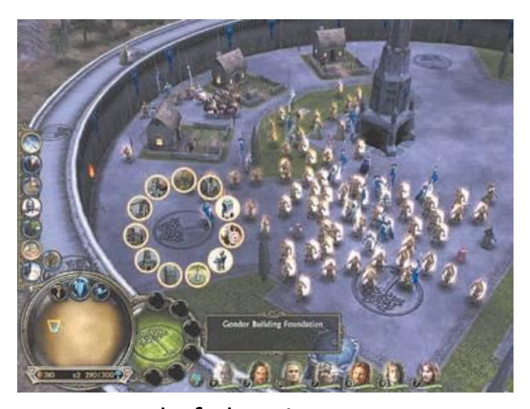
Lord of The Rings: The Battle for Middle Earth