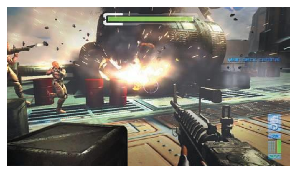
Perfect Dark Zero